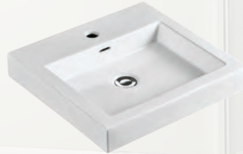
Square Top Mounted