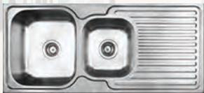
Abey 1 & 3/4 sink

Quality appliances and fixtures come together to offer a stylish and functional home to love for life.