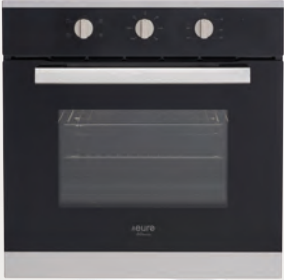
60cm Fan-forced Underbench Oven