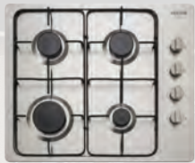
60cm Gas Cooktop