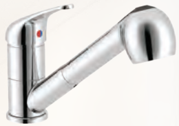
Abey Sink Mixer with pull-out spray