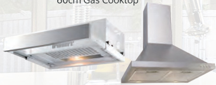
Choice of 60cm Slide-out Rangehood or 60cm Canopy Rangehood