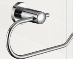
Accessories: Toilet Roll Holder