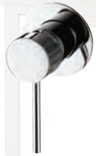
Shower Taps: Chrome Pin Mixer