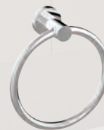
Accessories: Towel Ring