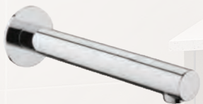
Bath Spout Chrome Pin Mixer