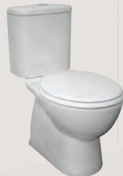
Toilet suites: Dual Flush Toilets with Soft Close