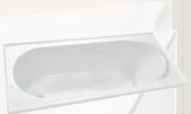
Bath: 1500mm or 1650 White Acrylic (room size dependent)