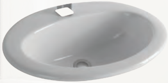
Circular Semi Recessed