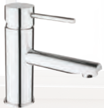
Basin Tapware: Chrome Pin Mixer