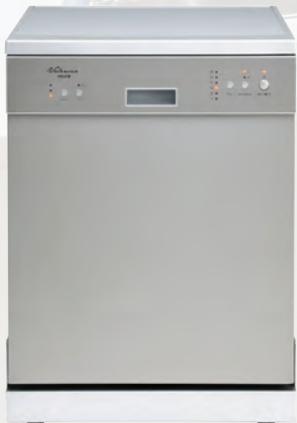
60cm Free-standing Dishwasher

Complete, fully functional kitchen including slide-out rangehood, stainless steel oven, stovetop and dishwasher.